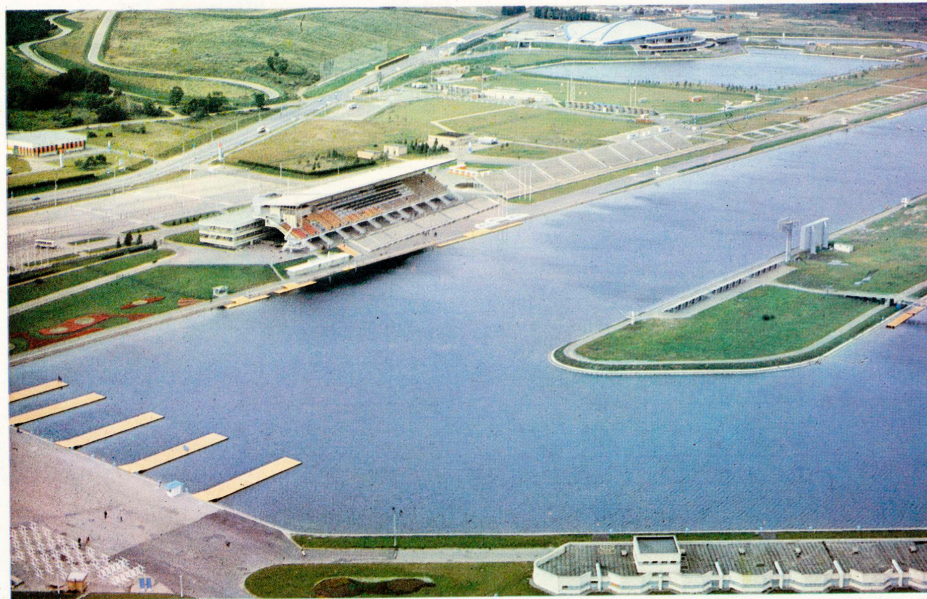
Bassin d'aviron et de canoë de Moscou The Moscow Canoeing and Rowing Basin