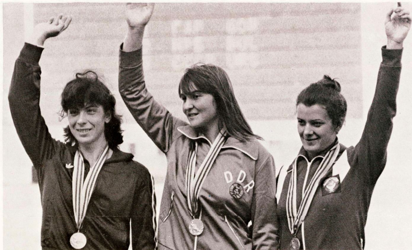
Birgit Fischer (GDR), la championne de K-1