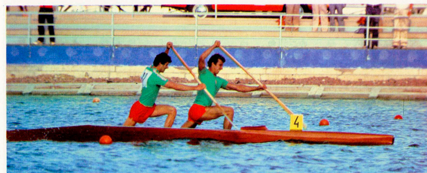
Départ de canoë biplace (1000 m)