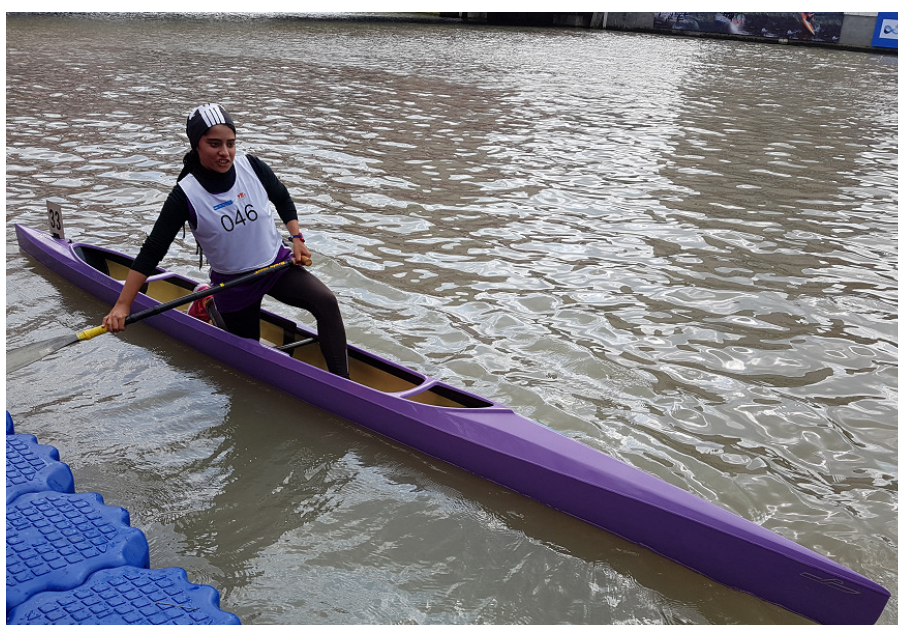
Iran took part in the event with a team of women junior C1 paddlers