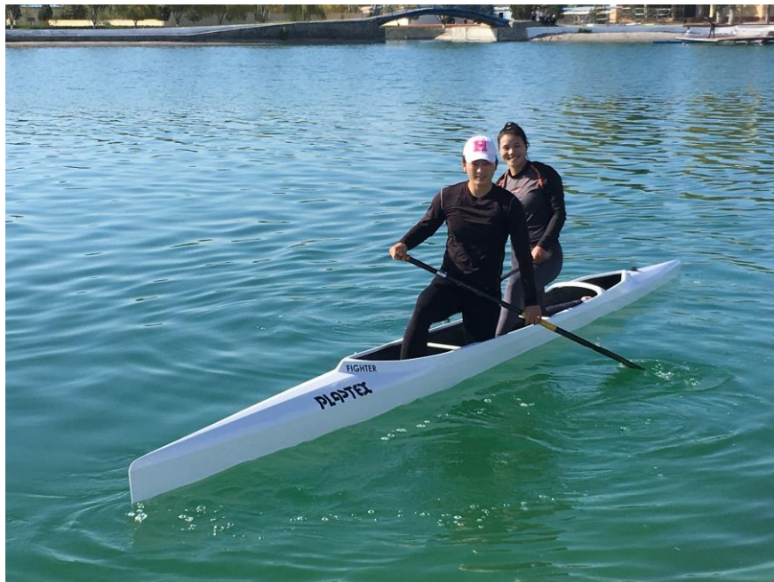
DPR Korea C2 became silver medalists in the Asian Jr U23 Championships in Uzbekistan, one of which who won two gold medals (in 200m and 500m)