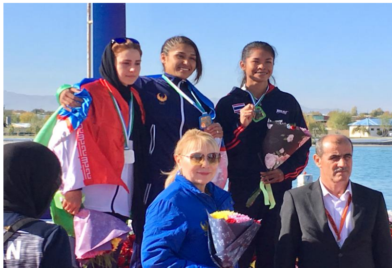
The three C1 W Athletes on the podium at the U23 Asian Champions Women all took part in the TIP Programme