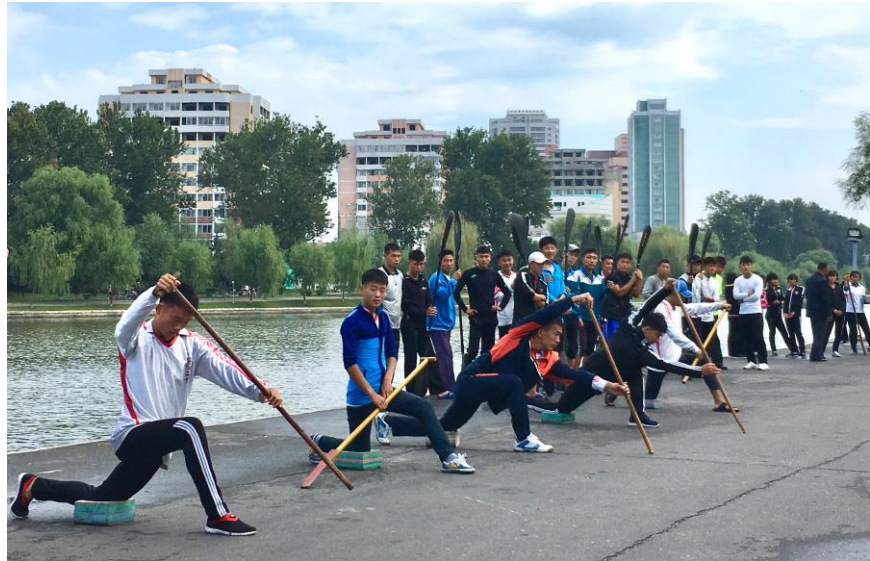
Coaches course during practical training in DPR Korea