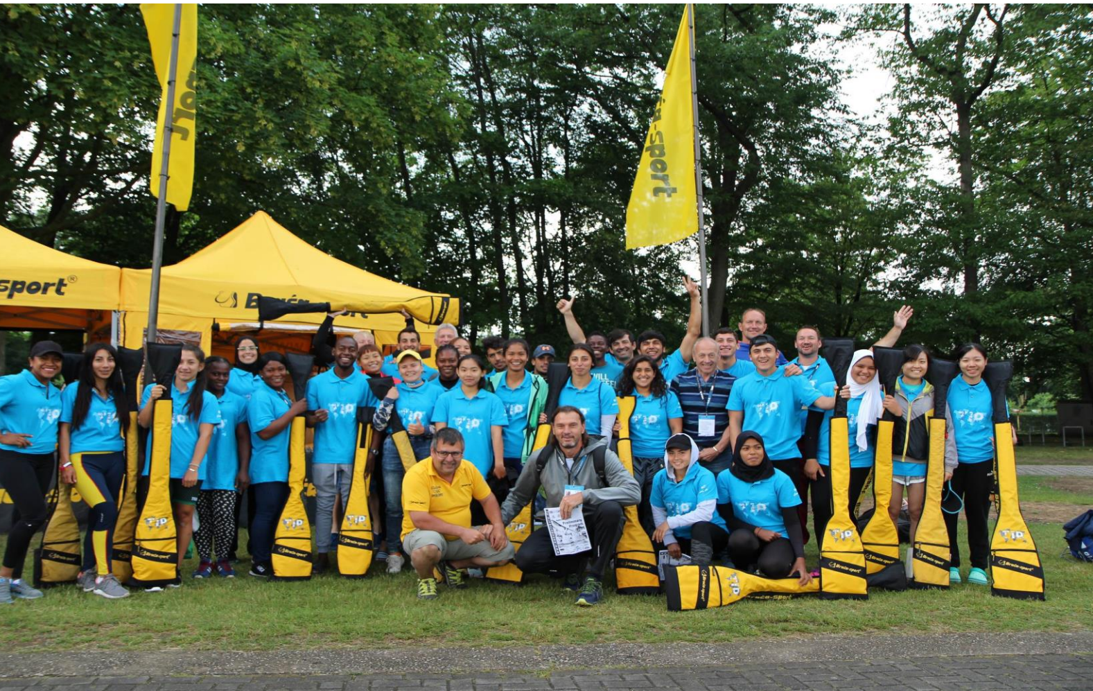
The TIP group in the CSP Senior Worlds in Montemor with BRACA 2018